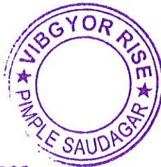
Principal Vibgyor Rise Pimple Saudagar